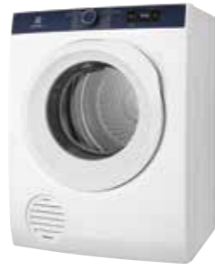
EDV705HQWA UltimateCare 500 SensorDry Dryer