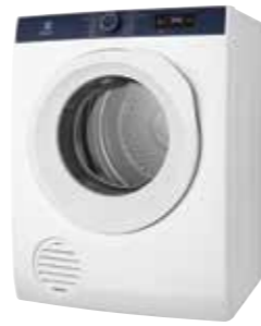
EDV605HQWA UltimateCare 500 SensorDry Dryer