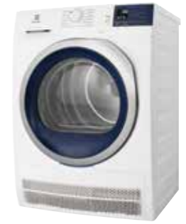
EDC804BEWA UltimateCare 700 SensiCare Dryer