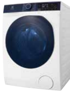
EWW1042ADWA UltimateCare 800 Series