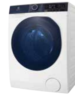
EWW9043ADWA UltimateCare 800 Series