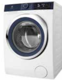
EWF9043BDWA UltimateCare 800 Series