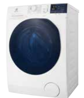
EWW7524ADWA UltimateCare 700 Series