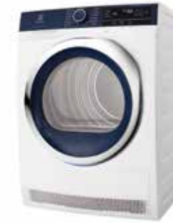
EDH803BEWA UltimateCare 800 DelicateCare Dryer