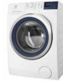
EWF8524CDWA UltimateCare 700 Series