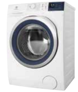
EWF7524CDWA UltimateCare 700 Series