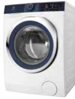
EWF1042BDWA UltimateCare 800 Series