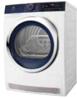
EDH903BEWA UltimateCare 800 DelicateCare Dryer